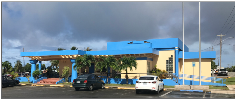
Clockwise: The Kotten Tinian courtroom; the Centron Hustisia on Rota; the Kotten Tinian.