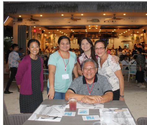
Judges enjoyed each other's company at last night's sunset dinner.